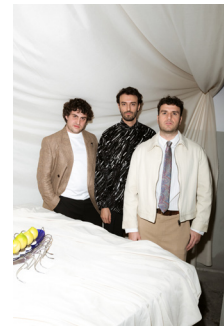
15 Parasite 2.0 @Elisa Turri