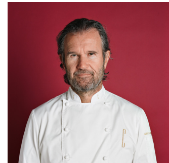
06 Carlo Cracco Chef