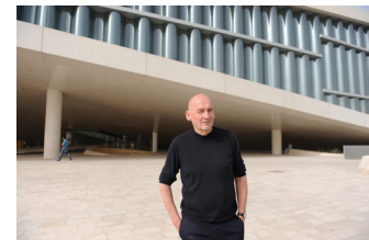
03 Rem Koolhaas Founder OMA Salone Contract Salone del Mobile.Milano 2026